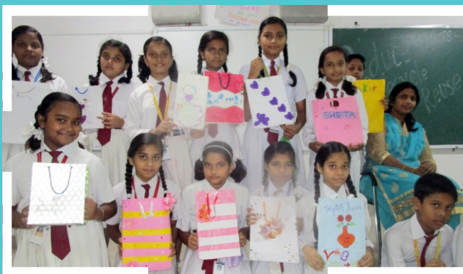
Paper Bag Making Activity