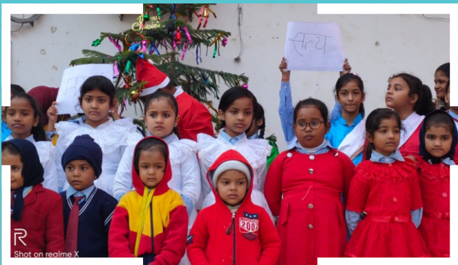
Christmas Day Celebration