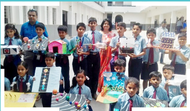
Science Exhibition (Junior)