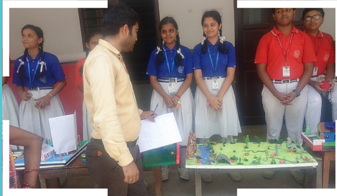
Science Exhibition (Senior)